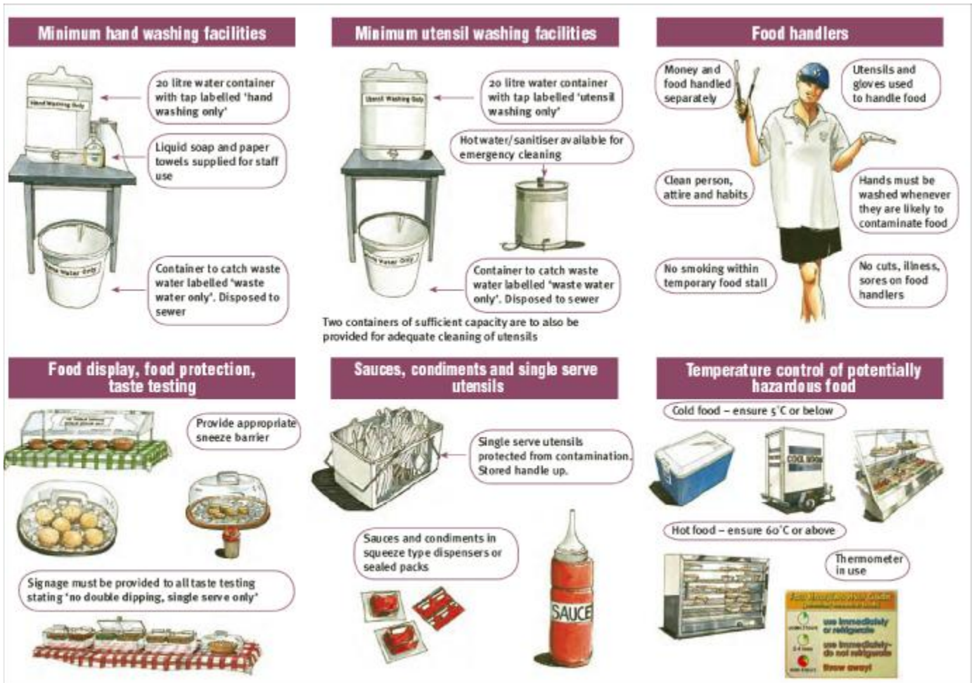
DIAGRAM OF FOOD STALL SET UP

All correspondence to be addressed to the Chief Executive Officer